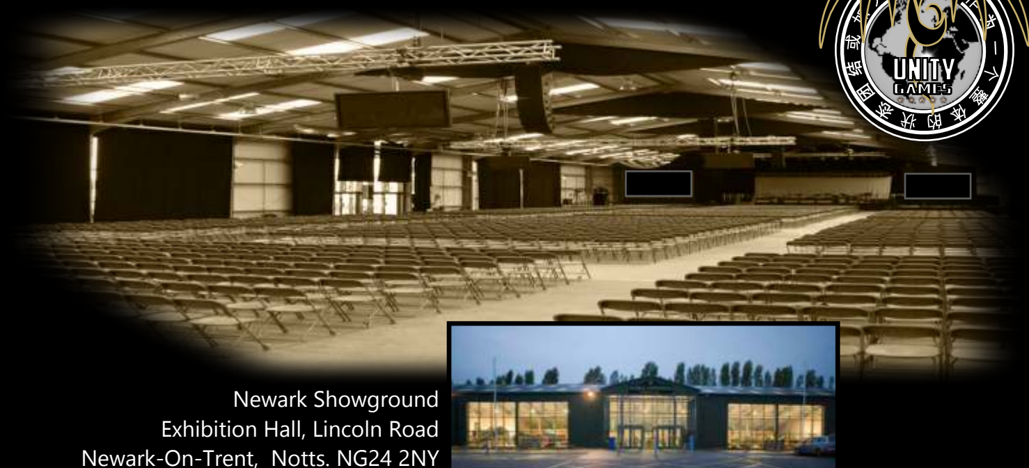
Newark Showground Exhibition Hall, Lincoln Road Newark-On-Trent, Notts. NG24 2NY

WORLD CLASS VENUE, WITH NIGHT SHOW SPECTACULAR